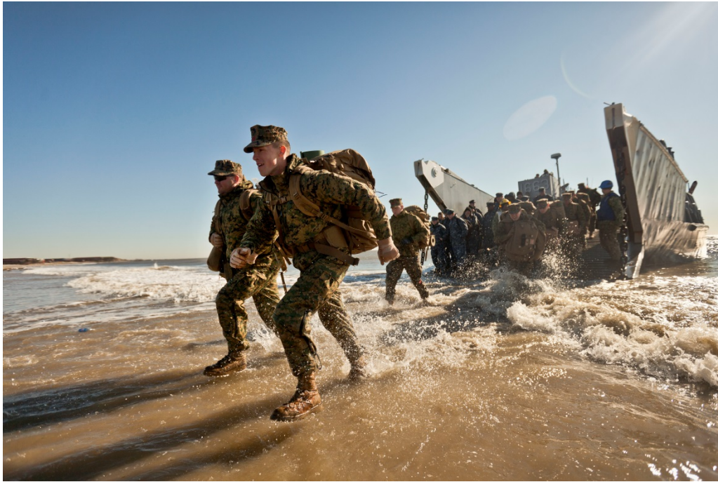
Marines and sailors assigned to the 26th Marine Expeditionary Unit step off a landing craft utility vehicle onto the shore of Breezy Point, New York, on Nov. 9, 2012. They and troops from other units partnered with the Federal Emergency Management Agency, the U.S. Army Corps of Engineers and the National Guard after Hurricane Sandy.

Superstorm Sandy provides a powerful example, as the storm's effects were exacerbated by the sea level in the New York Harbor, which had risen one foot since 1900. The storm had devastating impacts on the northeastern seaboard, impacting critical infrastructure. Hospitals were evacuated and train and roadway tunnels and waste water treatment facilities were flooded. All told, the storm left 8.5 million people without power and caused tens of billions of dollars in damages.