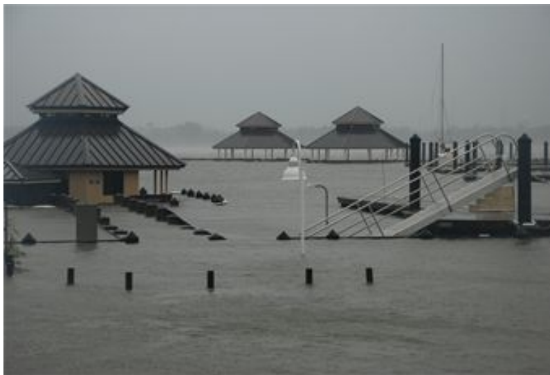
Flooding after Hurricane Gustav in 2010 at Keesler Air Force Base in Biloxi, MS.

Climate change will also impact the design of current and future weapons systems to account for extreme weather. Due to conditions such as prolonged temperature exposure, moisture, or sand, weapons planners need to plan for increased maintenance needs and more units in the field to maintain a ready force. In the future, planners must account for an increasingly hostile climate based on today’s trends.